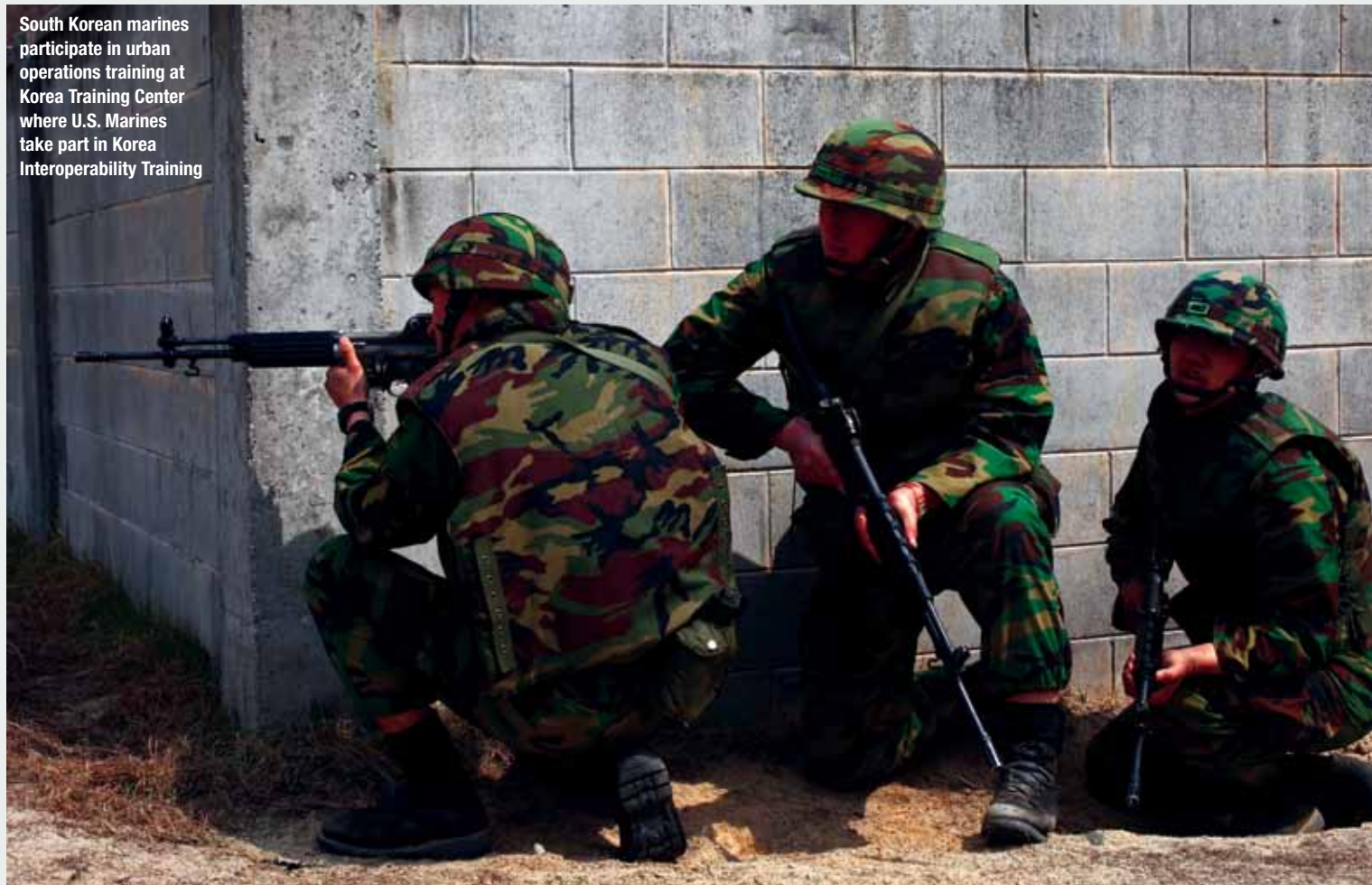
South Korean marines participate in urban operations training at Korea Training Center where U.S. Marines take part in Korea Interoperability Training

Recent developments on the Korean peninsula, from North Korea's 2010 sinking of the Cheonan to its continuing nuclear and ballistic missile activities in contravention of international sanctions, seemingly make discussion of reunification an academic exercise at best. Yet might an "outlier" be lurking? In 1989, few analysts were predicting the fall of the Berlin Wall or collapse of the Soviet