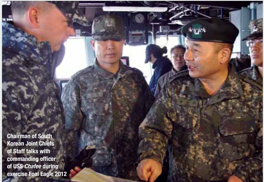
Chairman of South Korean Joint Chiefs of Staff talks with commanding officer of USS Chafee during exercise Foal Eagle 2012

Union. It thus behooves the South Korean government (and its strongest ally, the United States) to plan prudently for reunification, irrespective of timing and likelihood.