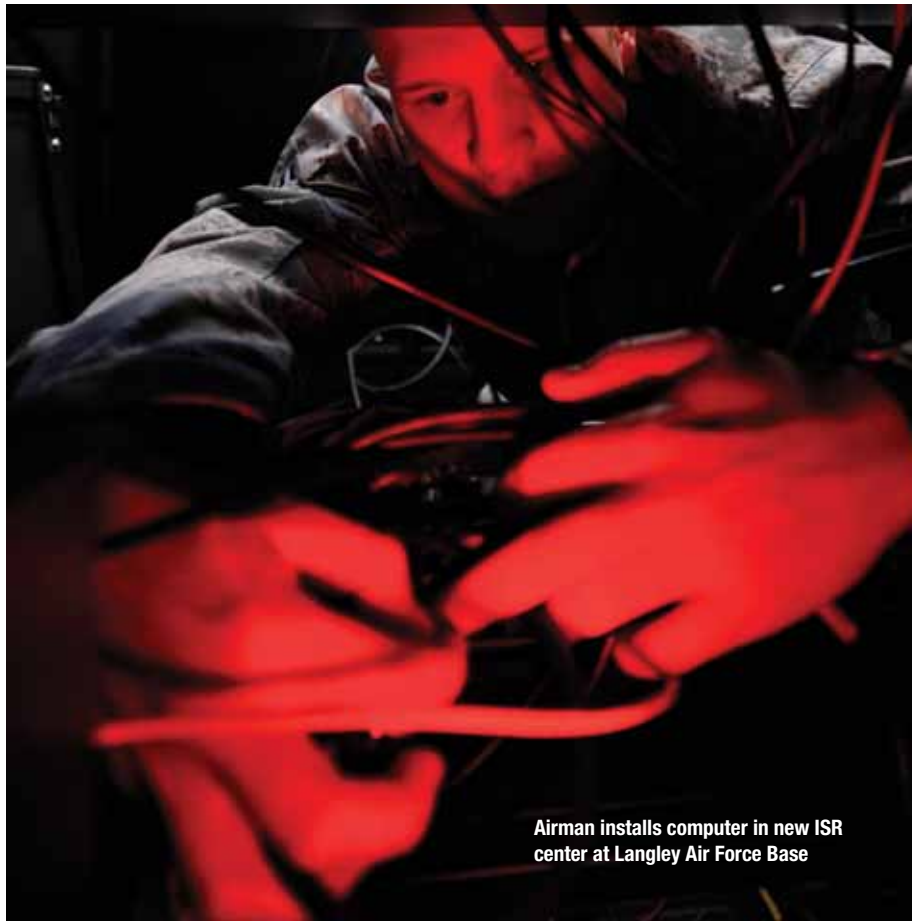
Airman installs computer in new ISR center at Langley Air Force Base