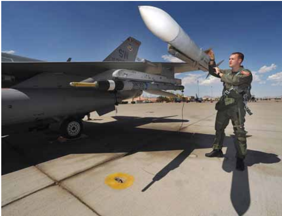
Pilot conducts preflight check of F-16CJ

domain than its target. This definition illuminates that inter-domain relationships (our own and our adversary's) create strategic vulnerabilities. 4 For example, U.S. precision conventional strike operations depend on access to multiple domains. A potential adversary might be incapable of destroying U.S. aircraft or nuclear-powered cruise missile submarines, but it might be able to attack the space and cyber assets that enable these platforms to destroy targets. This appears to be the logic underlying China's interest in counterspace and cyber attacks: such attacks shift the conflict to domains where China's offensive forces have an advantage over U.S. defenses, thereby altering U.S. capabilities in domains (air and sea, for example) where China would otherwise be at a disadvantage. 5 This cross-domain approach would be ineffective if U.S. air, sea, and ground forces did not depend heavily upon space and cyber assets. Without this link, China would be unable to translate U.S. vulnerability in space and cyberspace into an operational impact in other domains. Cross-domain attacks thus enable an actor to best utilize its strengths and exploit an adversary's vulnerabilities in some instances. Reports that the United States considered launching a cyber attack at the start of North Atlantic Treaty Organization operations in Libya suggest that the U.S. military also perceives cross-domain attacks as useful for exploiting adversary vulnerabilities. 6