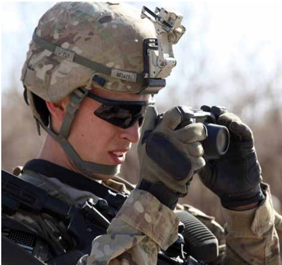
Soldier documents lay of the land with GPS camera in Afghanistan

Decisionmakers will also perceive attacks in space and cyberspace differently depending on the context. Attacks on military satellites and computer networks might be expected and accepted once a conventional war has started. But similar attacks might trigger a conventional conflict if they occur prior to hostilities, when both countries want to prevent a crisis from escalating into a war but are concerned about being left blind, deaf, and dumb by a first strike in space and cyberspace. Proportionality and escalation are relative concepts: actions that are escalatory during crises might be proportionate in limited wars and underwhelming responses as the scope and intensity of a conflict increase.