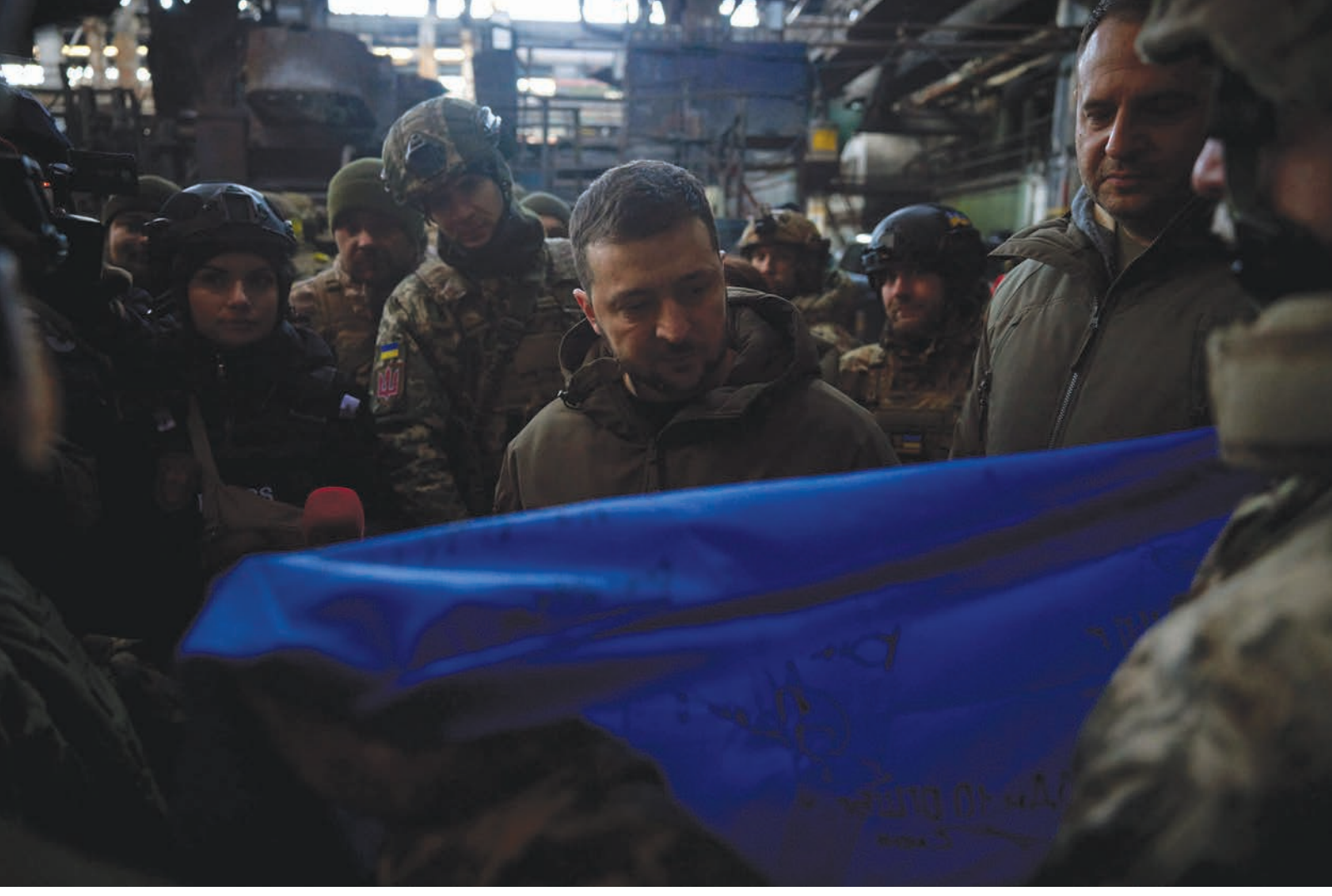
Ukrainian President Volodymyr Zelensky autographs Ukrainian flag for frontline troops during visit to defensive lines, December 20, 2022, in Bakhmut, Donetsk Oblast

been continuously strengthening its external communication capabilities to model RT's success in penetrating the Western mind. Russia's national system and information processes have created an increasingly complete and unique international communication system.14 In late 2015 the Sputnik Chinese News Service was officially launched; it successively opened Weibo and WeChat public accounts to increase official and unofficial cooperation between Russian and Chinese state-run media. In 2015, RT also signed a cooperation agreement with the China News Agency to carry out long-term cooperation on joint interviews and news events.