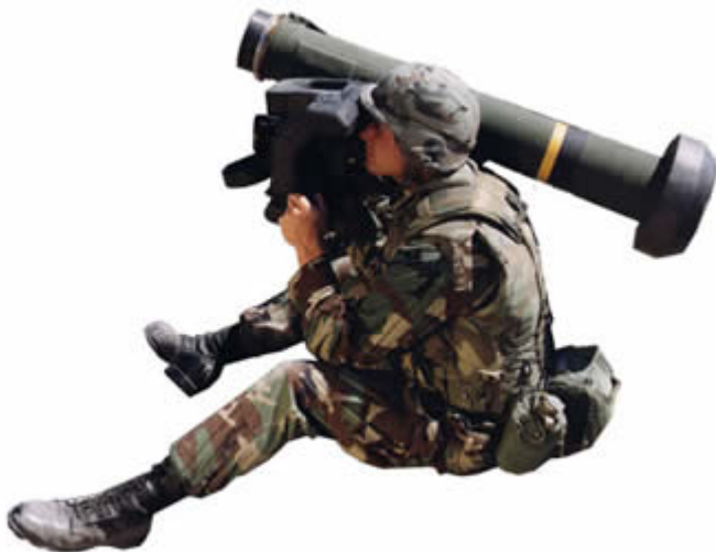
Figure 4. The Javelin gunner looks through the CLU. 55