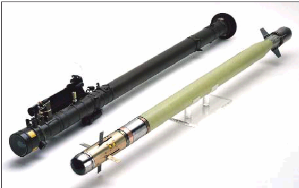
Figure 1. Stinger launch tube assembly (left) and Stinger missile round. 14

The Stinger is a heat-seeking, man-portable, air defense (MANPAD) missile. 11 The system consists of a reusable grip stock and a sealed launch tube with a five-foot-long missile. The grip stock and missile tube together weigh about 35 pounds. The weapon has a maximum altitude of about 10,000 feet, and a range of about five miles. Over 44,000 Stingers have been built. It is used by the U.S. Army (which plans to keep it in the inventory until at least 2018), the Marine Corps, and the Navy. 12 It is also used by numerous foreign nations. 13